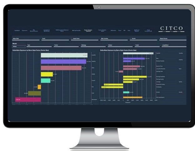
Citco dashboard with factor based analytics

Providing an invaluable insight into how systematic factors influence exposure, risk and overall fund returns, allowing amendments to investment strategy.