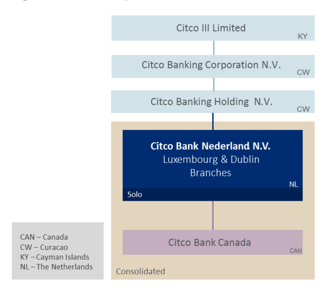
Figure 1. CBCA and parent structure:

CBCA is a wholly owned subsidiary of Citco Bank Nederland N.V., The Netherlands, which is a wholly owned subsidary of Citco III Limited, The Cayman Islands (the ultimate parent company).